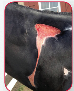
10 Weeks Post Injury